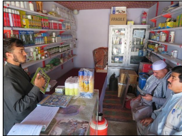
strengthen veterinary service for herder in Khulm, Balkh

3. Although privatized veterinary clinics were available at the district level the farmers and the veterinarian at the clinic did not have proper linkages or was too loose. PRB has strengthened this linkage through a participatory approach, trained both the women and men farmers and veterinarians for how to interact with each other and transfer the knowledge to other livestock owners. As a result of strong linkage established through vaccination, treatment, and deworming on time, the animal health status improved, mortality and morbidity reduced and the quantity and quality of cashmere and other animal products have been increased and improved. Solar fridges for keeping the quality of vaccine and a motorcycle for easy access to the farmers supplied to clinic