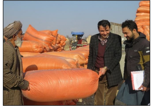
Coordination with the local authority in the distribution