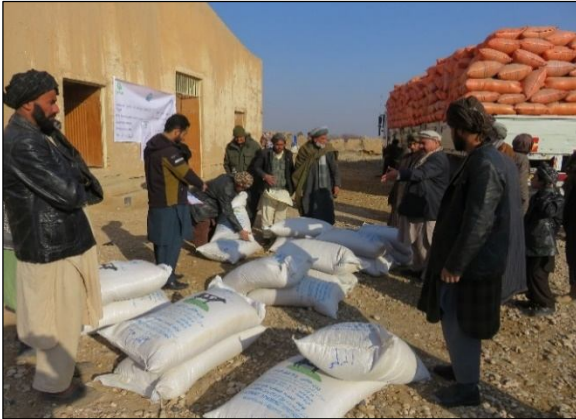
Distribution of livestock feeding to the vulnerable farmer during 2019 drought