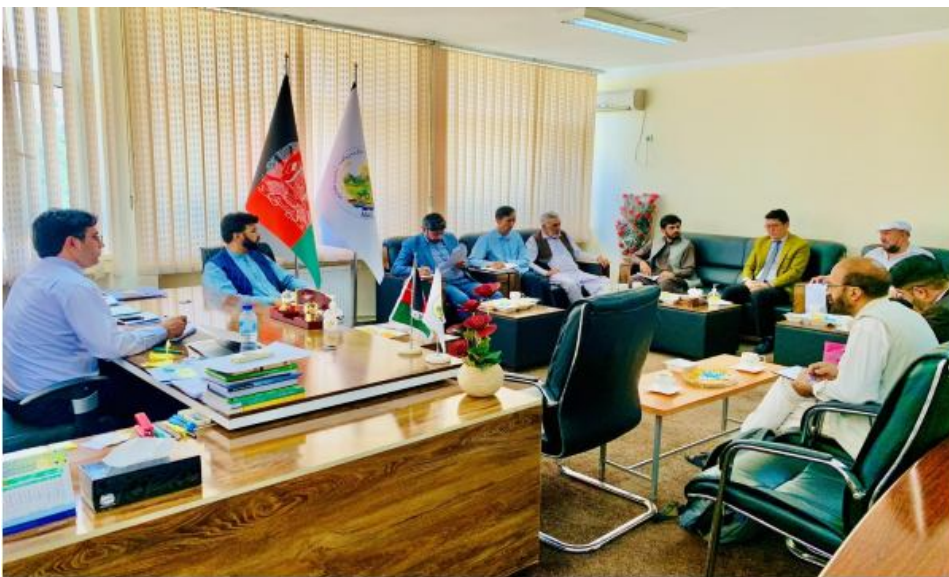
Advocacy meeting for cashmere policy with MAIL