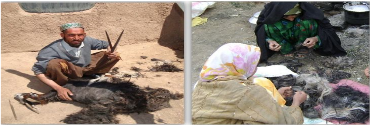
Goat harvesting and de-hairing by women

However, if awareness, training, and equipment for collection with linking to the market being focused, Afghanistan has the potential for increasing the cashmere production and the income of the farmers up to USD 50 per month.