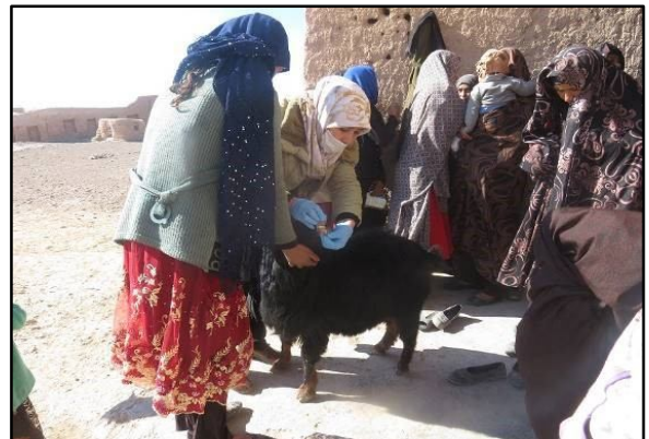
Practical training of females in cashmere harvesting