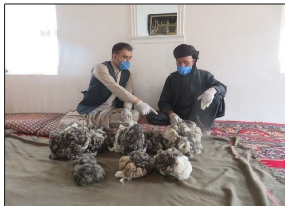
-Collecting cashmere from herders

4. The Shearing of goats for the collection of cashmere was non-technical and non-hygienic which might cause the sickness of the animals and spread many infectious diseases to humans. PRB trained the farmers and veterinarians that how to shear the goats with the use of technical equipment. At the end of the training, the required equipment was distributed to farmers. Shearing with technical equipment in consideration of hygienic conditions resulted in the prevention of diseases and collection of more cashmere, meanwhile increasing the quantity and improving the quality of cashmere.