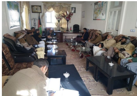
1Engaging local authority in project

Cashmere value chain production project was committed to support and empower goat farmers and cashmere producers in the target three districts of Herat and two districts of Balkh, while the project has influenced the neighboring provinces such as Samangan, Baghlan, Takhar, Badakhshan, Farah, Badghis, and Ghor. The main beneficiaries were those who had cashmere goats of which 2,750 were in 59 villages of 2 districts of Balkh and 4,122 in 49 villages of 3 districts in Herat including 30% women in Balkh and 30% in Herat. To make the program sustainable, two cashmere and other livestock product Associations were established in Charkent and Khulm districts of Balkh and 3 districts (Zenda Jan, Pashtun Zarghon, and Karukh) in Herat. These associations were initially registered with the Ministry of Justice and