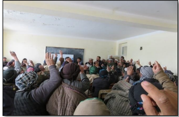
General Assembly for selection of CAO's management team