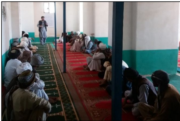
Herder training session in Herat