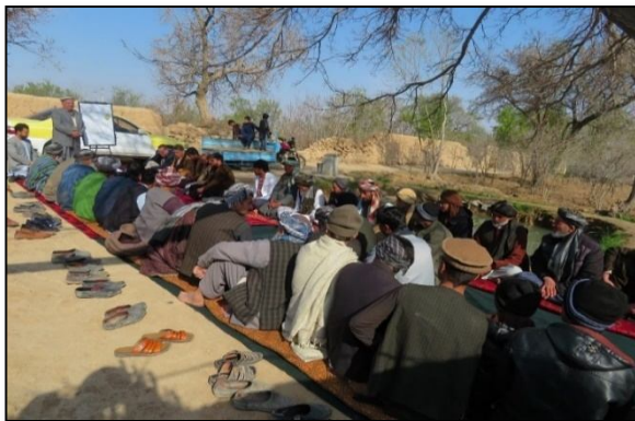
Photo- 2 Training session for herders in Khulm District