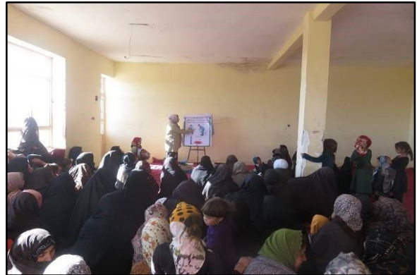
Female training session in Balkh